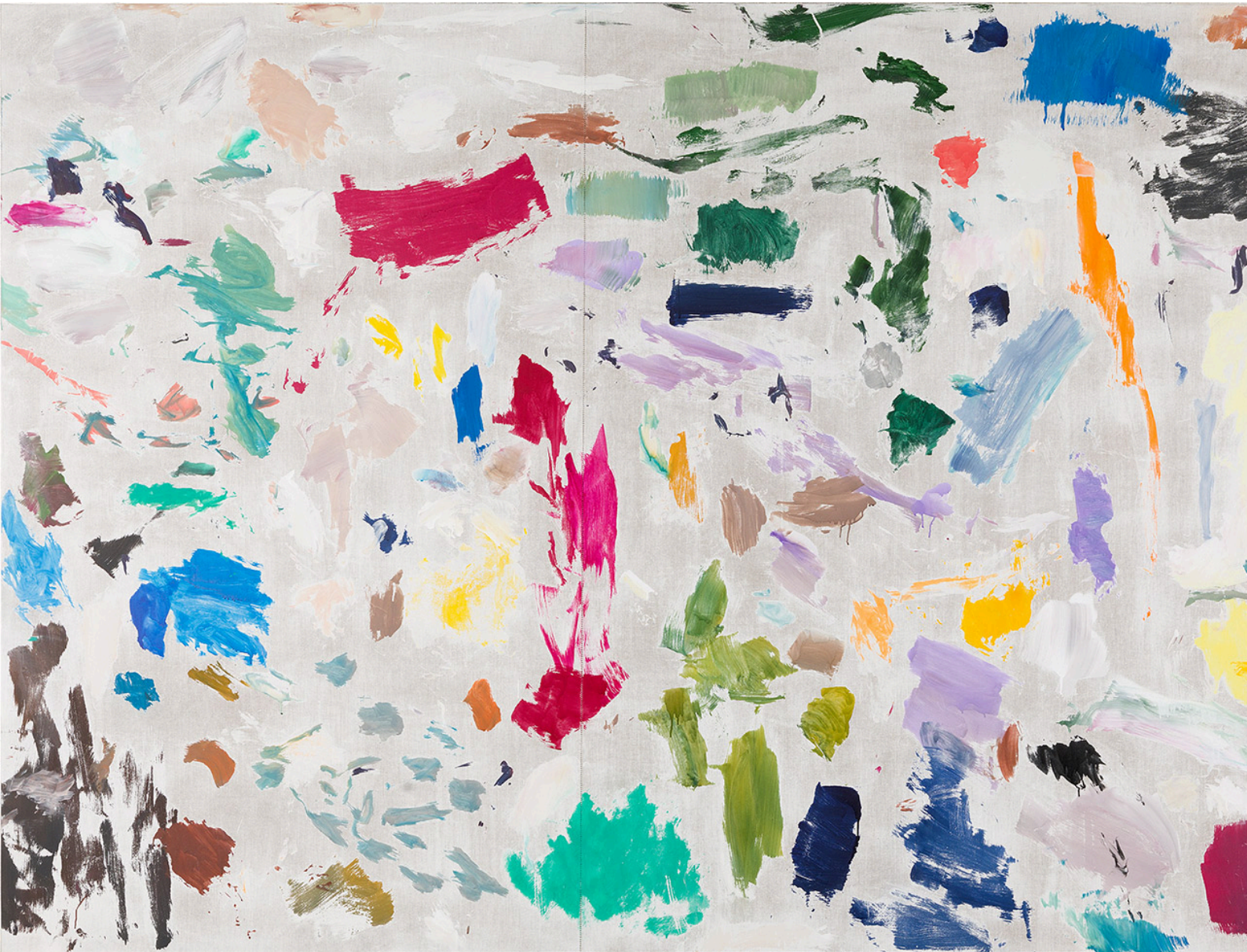
Secundino Hernández, Untitled , 2021