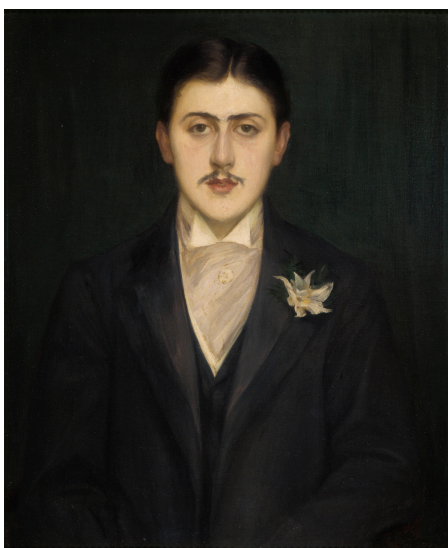
Jacques-Émile Blanche, Portrait of Marcel Proust , 1892

Among the masterpieces on display are works by masters such as Duccio, Van Eyck, Dürer, Caravaggio, Rembrandt, and Canaletto, alongside major figures of modern painting like Monet, Degas, Morisot, Van Gogh, Gauguin, Kirchner, Mondrian, O'Keeffe, and Hopper.