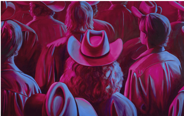
Ana Segovia, Through Mario's perspective (detail), 2024