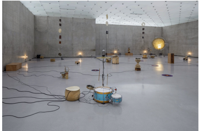
Tarek Atoui, performance view, Kunsthaus Bregenz, 2024

At-Tāriq is part of a research project on rural musical traditions across the Arab world, tracing trade routes and sub-Saharan pilgrimage paths. This first chapter is dedicated to Tamazgha , the North African region inhabited by the Amazigh people.