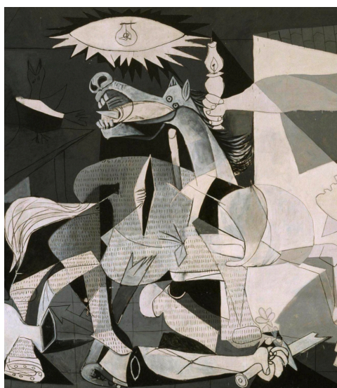
Pablo Picasso, Guernica (detail), 1937