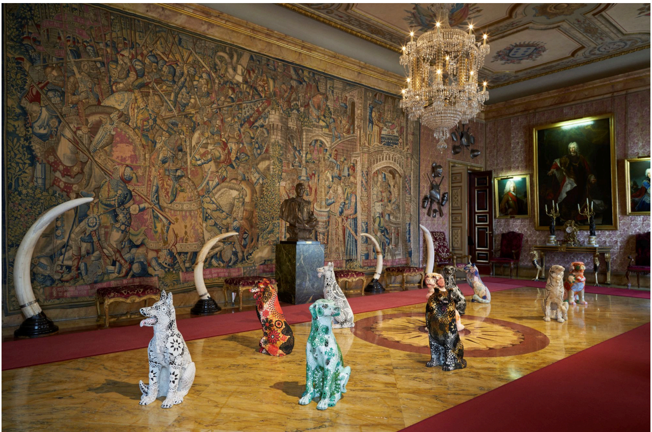
Joana Vasconcelos, Flamboyant . Exhibition view, Palacio de Liria, 2025

A journey through museums, galleries, and private collections to discover the Spanish capital, a city where art, history, and innovation come together.