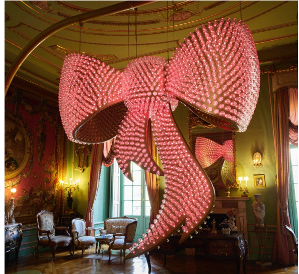
Joana Vasconcelos, Flamboyant , exhibition view, Palacio De Liria, 2025

In the exhibition Flamboyant , the artist presents over 40 works, offering a comprehensive view of her creative process. Her structures seamlessly integrate with the palace's environment, establishing a dialogue between contemporary art and masterpieces by artists such as Velázquez and Goya. The works naturally adapt to the historic rooms, some of which are being opened to the public for the first time, including the chapel, the music room, and the gardens.