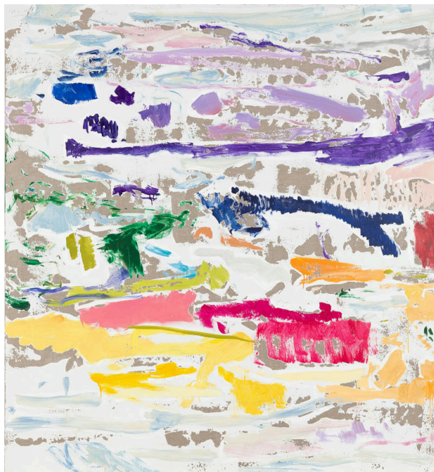
Secundino Hernández, Untitled , 2024

The exhibition brings together nearly 70 works, from his early pieces in 1996 to a monumental polyptych over nine meters long, created in 2025. Rather than following a chronological order, the exhibition is structured into four thematic sections: drawing as the foundation of painting , the treatment of surfaces as a plastic space , form within pictorial composition and the use of the human figure —an unusual exploration in his predominantly abstract work.