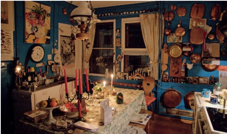
Casa Segantini in Maloja

We have taken care of every detail of an exclusive programme, designed to offer you a complete immersion in the artistic and cultural atmosphere of this enchanting place.