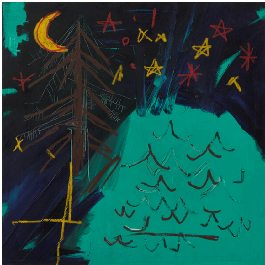
Jean-Michel Basquiat, See (Lake) , 1983

Jean-Michel Basquiat found an unexpected source of inspiration in the Engadin, a place where his vibrant aesthetic and visual language merged with the Alpine landscape and its culture. Fascinated by the contrast between the metropolitan bustle of New York and the contemplative quiet of the Swiss mountains, Basquiat translated this dichotomy into works incorporating references to nature, history and the cultural identity of the place. The exhibition Jean-Michel Basquiat. Engadin , hosted at Hauser & Wirth St. Moritz, is the first tribute entirely devoted to the artist's works made in Switzerland and those inspired by his frequent stays in the country.