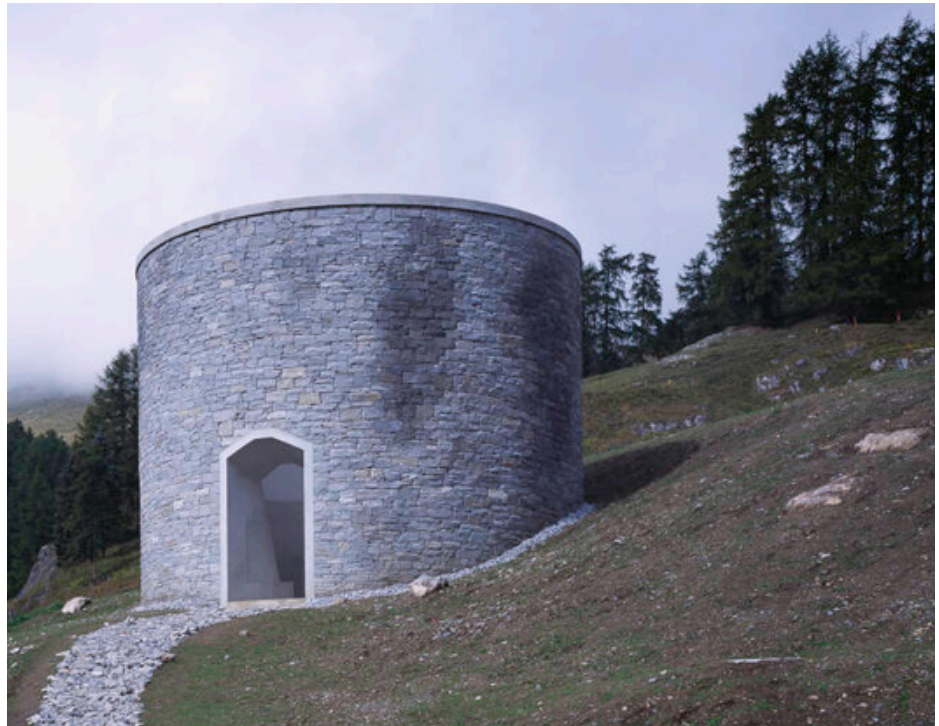
James Turrell, Skyspace Piz Uter , 2005

Skyspace at Piz is an extraordinary installation by the artist in which light and space intertwine in an immersive work that redefines the perception of the sky and the Alpine landscape, offering a profound reflection on the relationship between environment, colour and visual sensation.