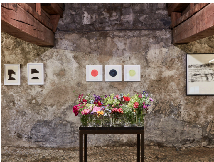
10 Ons. Exhibition view.