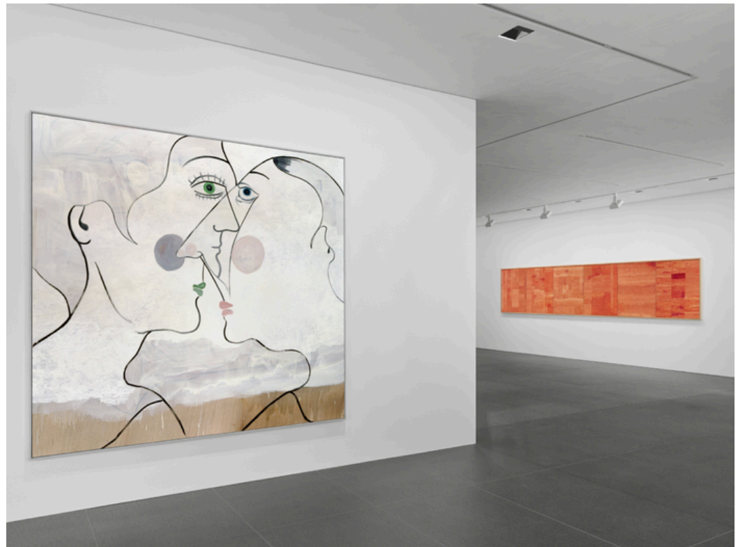
In Good Company . Exhibition View.

The exhibition traverses, among many artistic currents, the metaphysical avant-garde of de Chirico , the powerful expressionism of Baselitz , the conceptual experimentation of Boetti and the daring visions of Condo and Fleury , up to the masters of modernity such as Miró and Picasso . An itinerary that highlights the evolution of painting, sculpture and conceptual art, offering a dialogue between eras, languages and artistic research that continue to influence the contemporary scene.