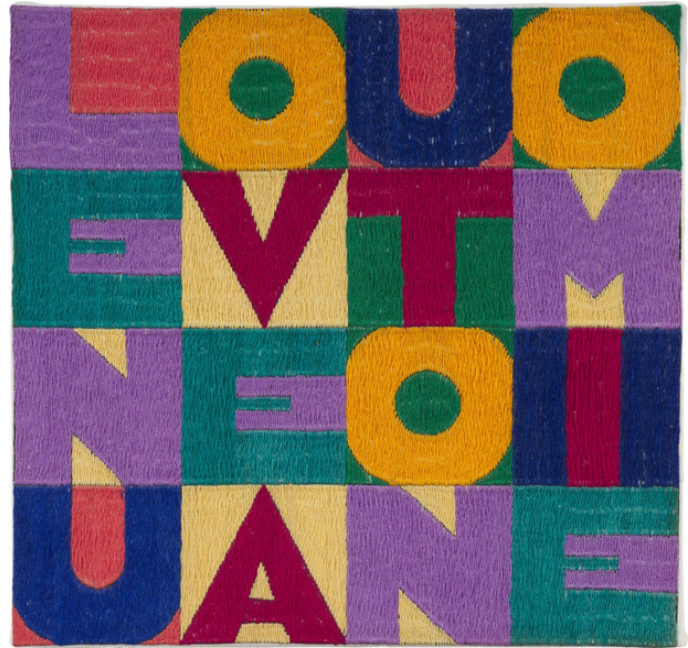
Alighiero Boetti, Le nuove autonomie , 1979

The exhibition Le Nuove Autonomie , presented by Larking Erdmann Gallery, explores the concept of artistic autonomy through the works of Alighiero Boetti , Max Bill , Antonio Calderara , Marcel Duchamp , Jannis Kounellis and Man Ray . Each of these artists redefined the boundaries of art, experimenting with new languages and materials. A path that reflects on how art can emancipate itself from traditional schemes to find new forms of autonomous expression.