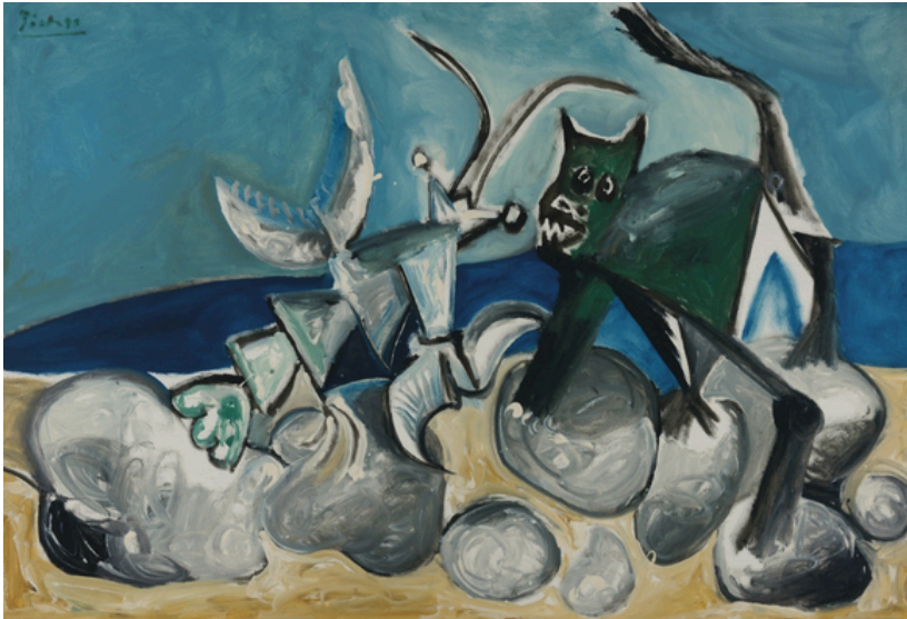
Pablo Picasso, Homard et Chat sur la Plage , 1965

Curated by Bob Colacello, the exhibition The Neverending Story: Part II at the Vito Schnabel Gallery celebrates the centenary of Surrealism, paying homage to the movement born in Paris in 1924 with André Breton's Surrealism Manifesto. Breton imagined a fusion of dream and reality in a new absolute dimension, a 'surreality', a concept that this exhibition explores through a dialogue between historical and contemporary works, bringing together artists such as Salvador Dalí , Giorgio de Chirico , Max Ernst , Francis Picabia , and Pablo Picasso , alongside successors such as Jean-Michel Basquiat (in collaboration with Andy Warhol ), Ai Weiwei , Francesco Clemente , David Salle and Kenny Scharf .