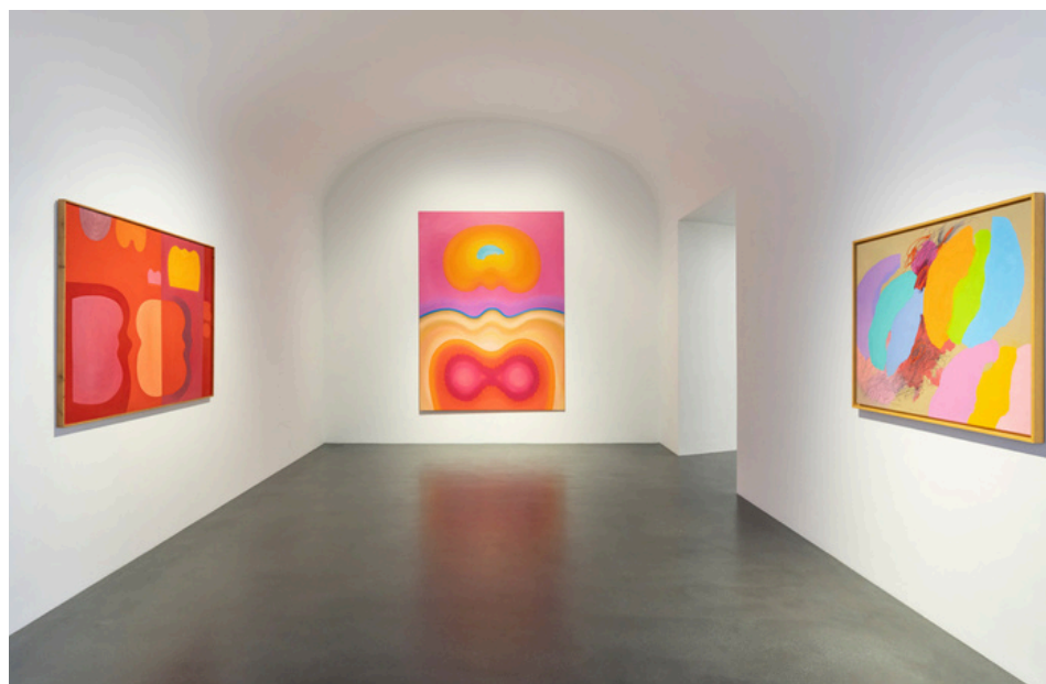
Ilona Keserü, Flow . Exhibition View.

Ilona Keserü intrudes contemporary abstraction with Hungarian popular culture and European iconographic references. Her work, which matured in a political and cultural context marked by Soviet rule, challenged the imposed canons, resulting in a sensorial and layered visual repertoire. A distinctive element of her practice is her bold use of colour and organic forms, which brings her close to figures such as Eva Hesse, Louise Bourgeois and Judy Chicago.