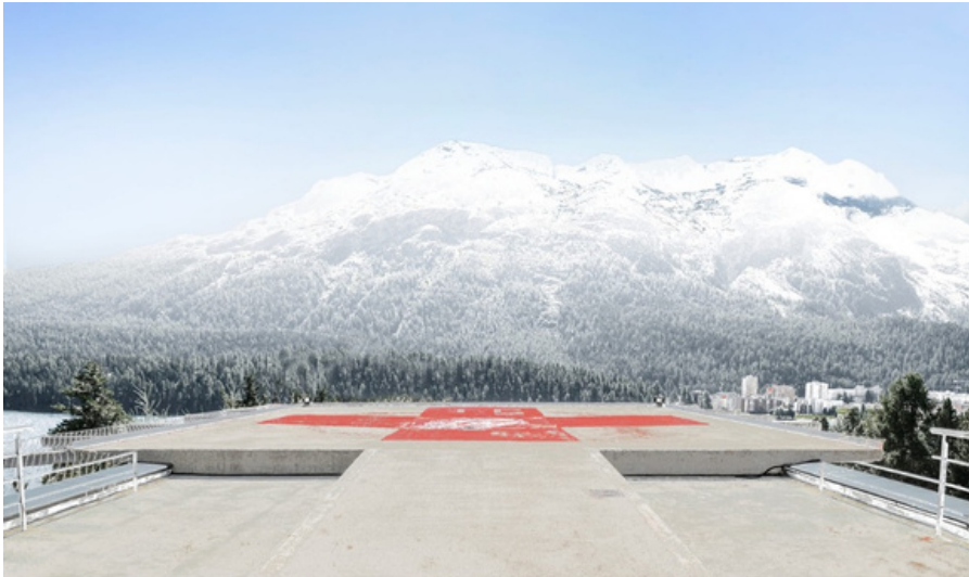
Nomad St. Moritz 2025

Nomad St. Moritz is a fair that combines art, architecture and design, where we explore the most innovative works of international artists and designers. It stands out for its strong research, conceived to offer an alternative experience to traditional art fairs. Its philosophy lies in the desire to redefine the way art is experienced, transforming fruition into an authentic and immersive experience.