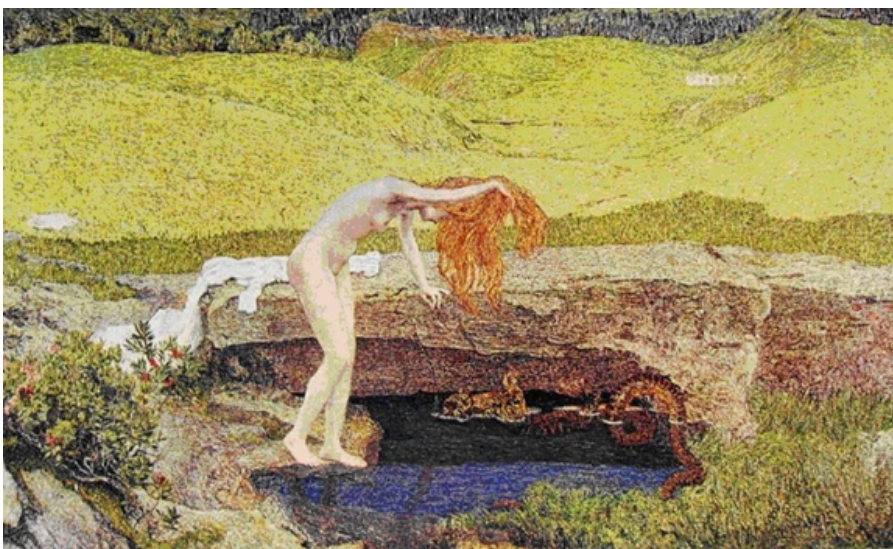
Giovanni Segantini, La vanità , 1897

Set against a backdrop of extraordinary beauty, Casa Segantini in Maloja represents a symbolic place where history and art intertwine in the memory of Giovanni Segantini. Here, within the walls that were once his home, one can still sense the deep connection between the artist and the Engadine landscape, whose light and atmosphere inspired some of his most iconic works. Segantini himself described his affinity with Maloja in a letter, writing: 'I have begun to take possession of these places, which are a true mine for my art'. Today, his creative universe lives again through a tour that includes a visit to his atelier, the family tomb and the evocative Segantini Trail, an itinerary that allows visitors to retrace the fundamental stages of his artistic production.