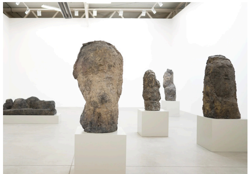
Hans Josephsohn, Sculptures 1969 - 1998. Exhibition view.