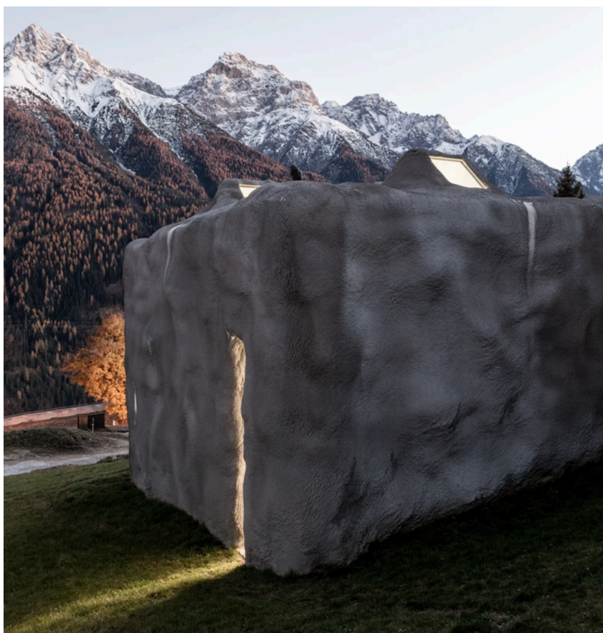
Studio Not Vital

Jean-Michel Basquiat found an unexpected source of inspiration in the Engadin, a place where his vibrant aesthetic and visual language merged with the Alpine landscape and its culture. Fascinated by the contrast between the metropolitan bustle of New York and the contemplative quiet of the Swiss mountains, Basquiat translated this dichotomy into works incorporating references to nature, history and the cultural identity of the place. The exhibition Jean-Michel Basquiat. Engadin , hosted at Hauser & Wirth St. Moritz, is the first tribute entirely devoted to the artist's works made in Switzerland and those inspired by his frequent stays in the country.